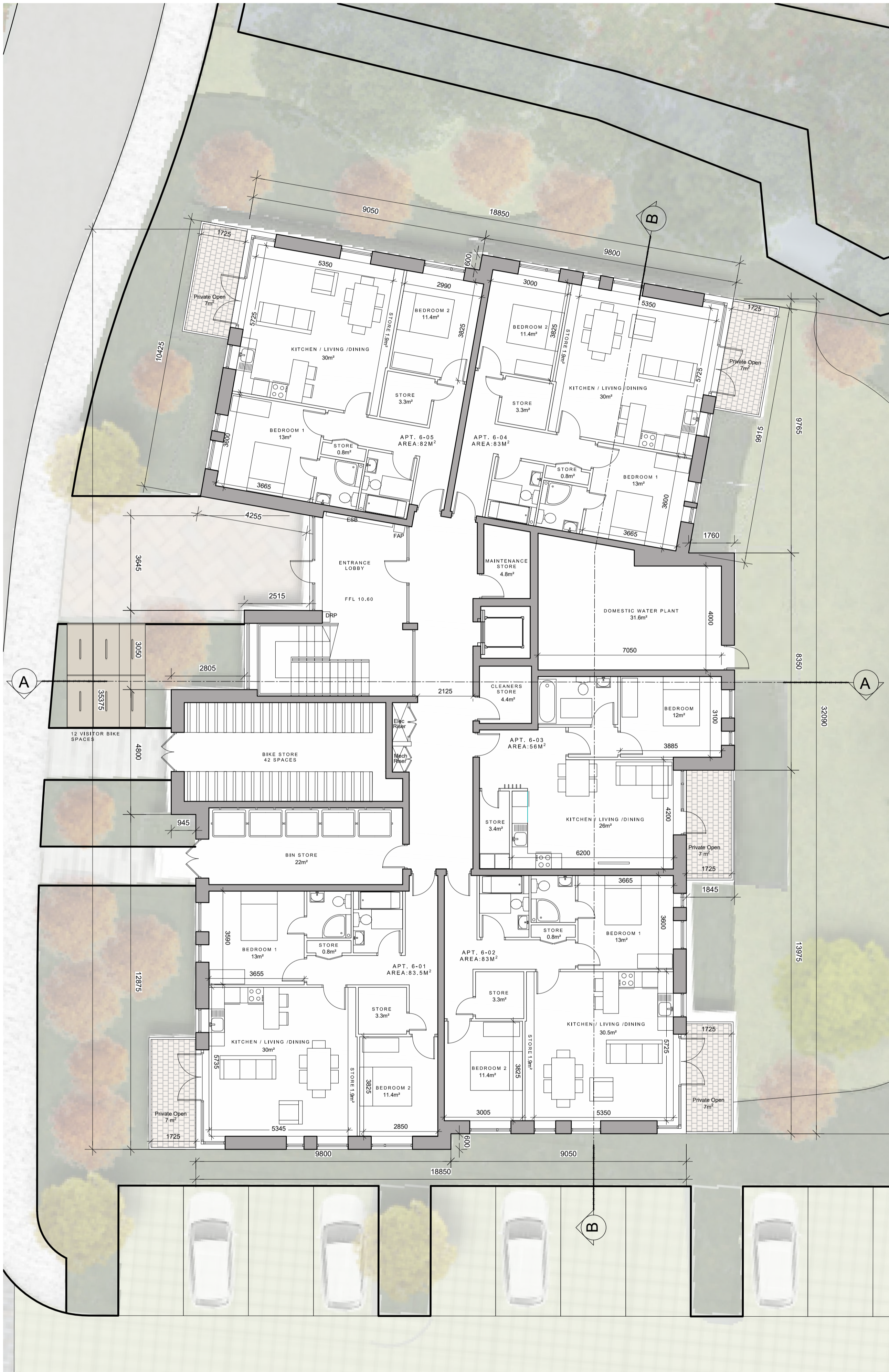
BLOCK 6 GROUND FLOOR PLAN SCALE: 1:100 SEE THE BIG SPACE LANDSCAPE ARCHITECTS' DRAWINGS FOR DETAIL OF LANDSCAPE TREATMENT