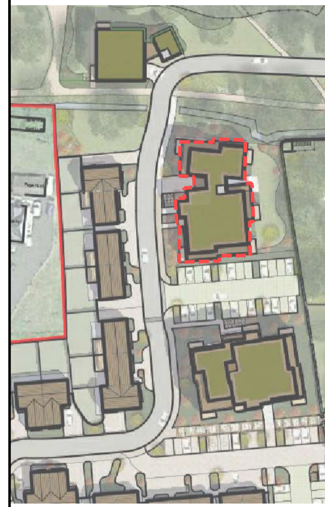
KEY PLAN INDICATING POSITION OF APARTMENT BLOCK 6 NOT TO SCALE